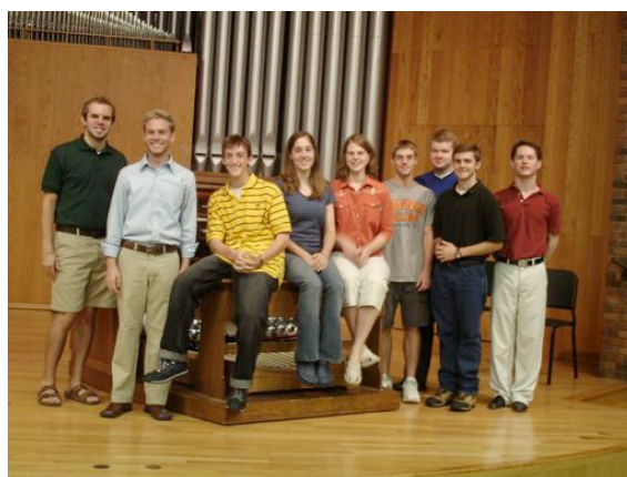
(current organ students at Carson-Newman)